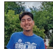
School Board Race, p.6