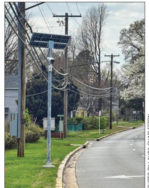
A stop sign camera on Southway

During May, Greenbelt issued 11,066 citations, according to the city's financial report. Drivers paid 1,835 stop-sign camera citations so far, generating $73,400 in fines, of which $37,434 was distributed to the City of Green-