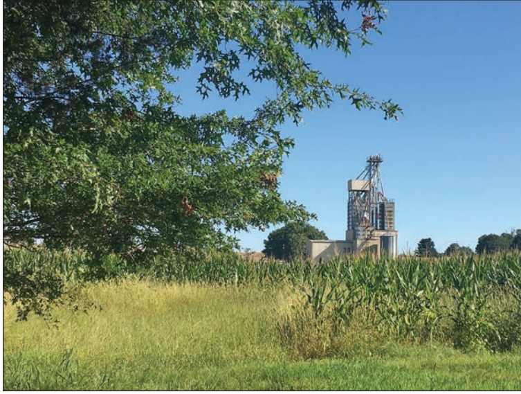
A view of BARC on August 30, 2025

On Monday, June 29, the remaining (non-union) scientists on the Beltsville Agricultural Research Center (BARC) campus received relocation letters. They were given the deadline of July 29 to commit to the move and a requirement to report to duty in their new location on October 5, a Greenbelt scientist told the News Review. As of the end of the day on Monday, union workers, including technicians, farm crew and administrative staff, had not received letters, said the source. One Greenbelt resident who is a research technician at BARC, and part of the union, told the News Review he too learned which state he is being relocated to on Monday, but received only verbal notification. The “regular scientific employees” had not received any written notifications due to union negotiations, he said.