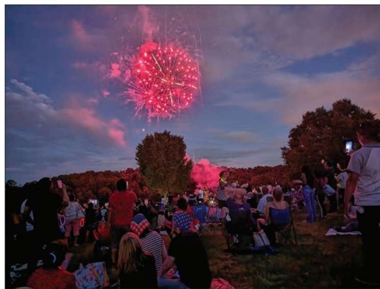
The firework celebration at Buddy Attick Park on July 4, 2023