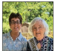
95th Birthday Celebrations, p.4