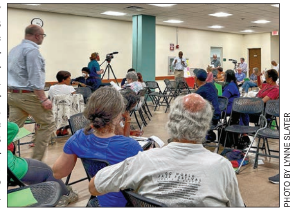
Reparations Commission town hall on June 27

From Greenbelt's establishment until 1952, Greenbelt policy prohibited African Americans from purchasing homes. African American workers who helped build the city under the Works Progress Administration (WPA) program were not permitted to apply to live here. Redlining, GHI screening, “standard” lending practices and outspoken opposition to housing integration in the 1960s indicate long-term prevention of African Americans from home ownership in Greenbelt. Two specific harms were identified within this category: Housing Discrimination and Unsafe Living Conditions