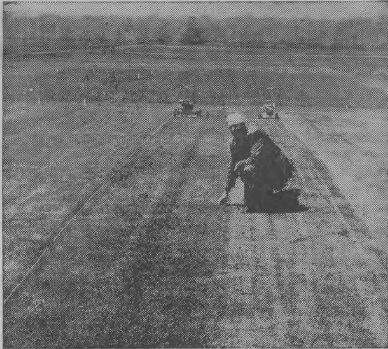
Cut with a reel-type