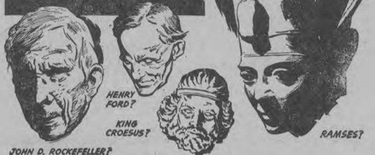
JOHN D. ROCKEFELLER?

RAMSES, EGYPTIAN RULER OF THE 13th CENTURY, B.C., COULD HAVE BOUGHT THEM ALL OUT—AND AT THE SAME TIME!! THE ESTIMATED WORTH OF HIS NUBIAN MINES ALONE WAS OVER $10,000,000,000!!