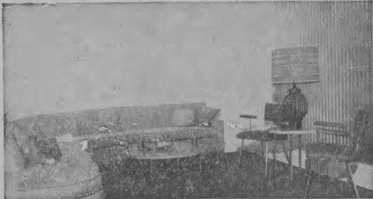
A blank wall in this living room (above) can be made to provide generous storage facilities in the manner shown in the drawing below. The same solution can be applied to any room in any home.

The magazine lists these standards for determining the adequacy of storage space: Size—storage units should be big enough to take care of all present and foreseeable needs; accessibility—proper design eliminates the frustrations of groping into blind corners or having to reach over a large object to find a small one; efficiency—storage units should be planned to accommodate the objects that will be stored there with a minimum of waste space; flexibility—as years pass, habits of a family change, its possessions change and increase; storage facilities should be planned to allow adjustment for these changes.