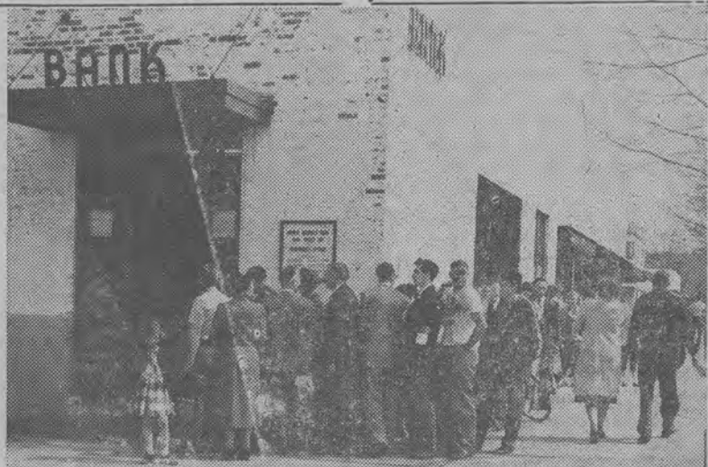
Greenbelters lined up as the bank opened Monday, April 18, to deposit their $100 good faith payments as members of Greenbelt Veterans Housing Corporation. First-comers received high priority on the membership list in future selection of dwelling units.

The board voted to tighten up its procedures for minutes and financial reports and approved prices for detached homes on Woodland Way.