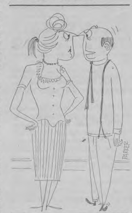
Why should I protest about the kindergarten? I don't have to stay home all day.

ing meetings,' instead of 'Should we have meetings quarterly, twice a year, annual only,' the results might have been entirely different." More important than the actual answers themselves, he felt, was the fact that the survey pointed out how little most people know about their cooperative organization, and that almost everyone would like to he ve more information.