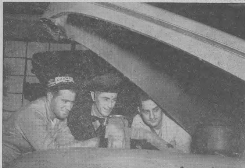
Three Heads are Better Than One

Trouble under the hood — that's when three heads are better than one, and it's this same type of teamwork and cooperation that solves knotty problems and has built business for the Service Station.