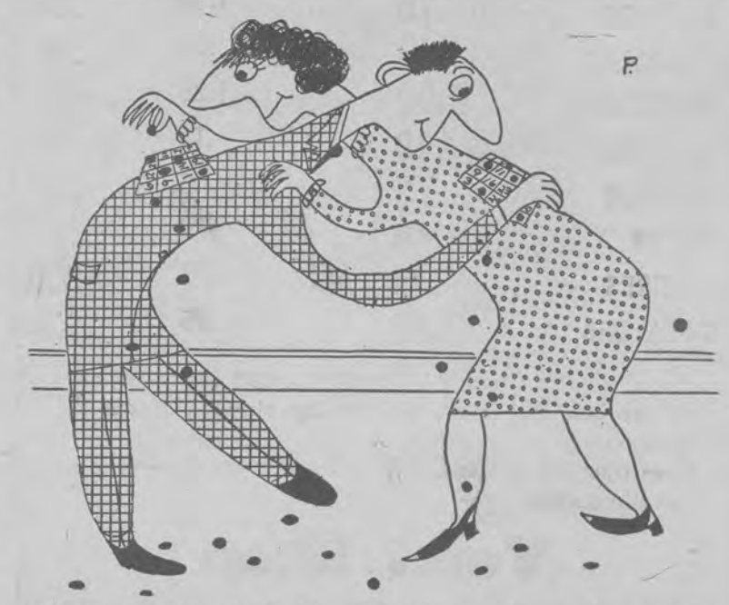
The cooperative spirit: He wanted to play bingo, she wanted to dance.

The board of GMHOC, in an effort to retain a group eligible to purchase undeveloped land while GVHC attempts to buy the homes, maintained its identity and that of GMHOC, so that there are actually two organizations. The former GMHOC membership (nearly two-belongs to the more recent GVHC, while GMHOC's present membership is comprised totally of its board of directors,