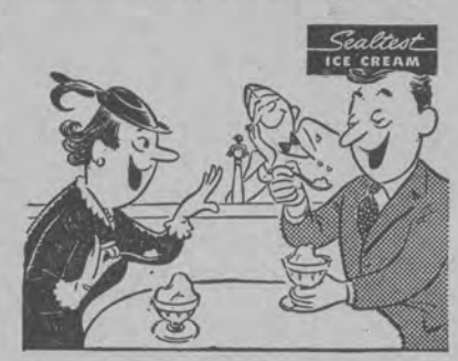
Be smart! Let Sealtest save the day!

Anytime, enjoy Sealtest Ice Creama Try "REAL PINEAPPLE," Flavor-of-the-Month for August.