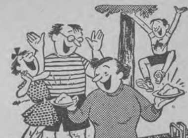
Cheer Up! Let Sealtest save the day!

Anytime, take time for Sealtest. Try "Lemon Flake," Sealtest Flavor-of-the-Month for July. Get the Best—Get Sealtest!