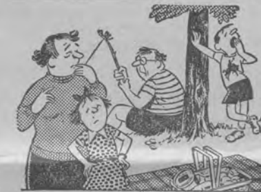
Picnic Doldrums from too much play?