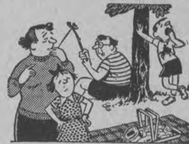
Picnic Doldrums from too much play?