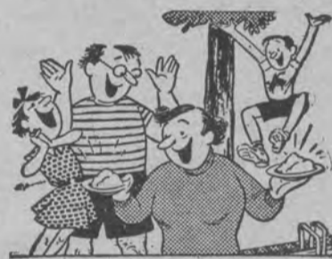
Cheer Up! Let Sealtest save the day!

Anytime, take time for Sealtest. Try "Lemon Flake," Sealtest Flavor-of-the-Month for July. Get the Best—Got Sealtest!