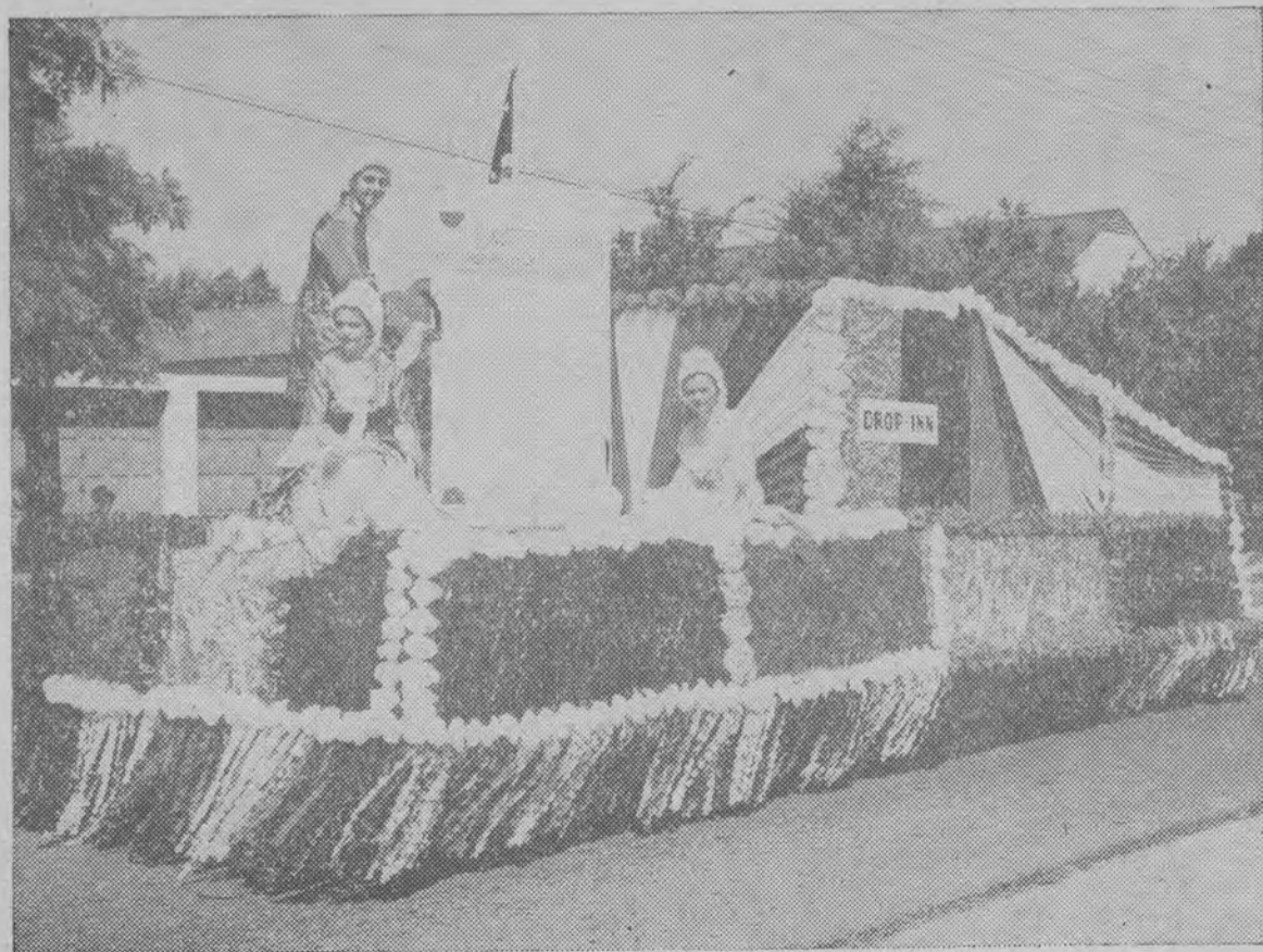
First-prize Winning Float of the Greenbelt Youth Center.

Summer concerts throughout the rest of the summer will be held on the platform erected between the