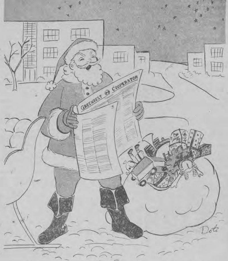
Now let's see—who's been good and who's been bad.