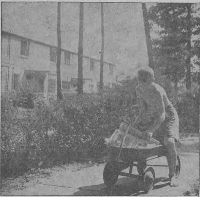
Greenbelt keeps busy in the summertime