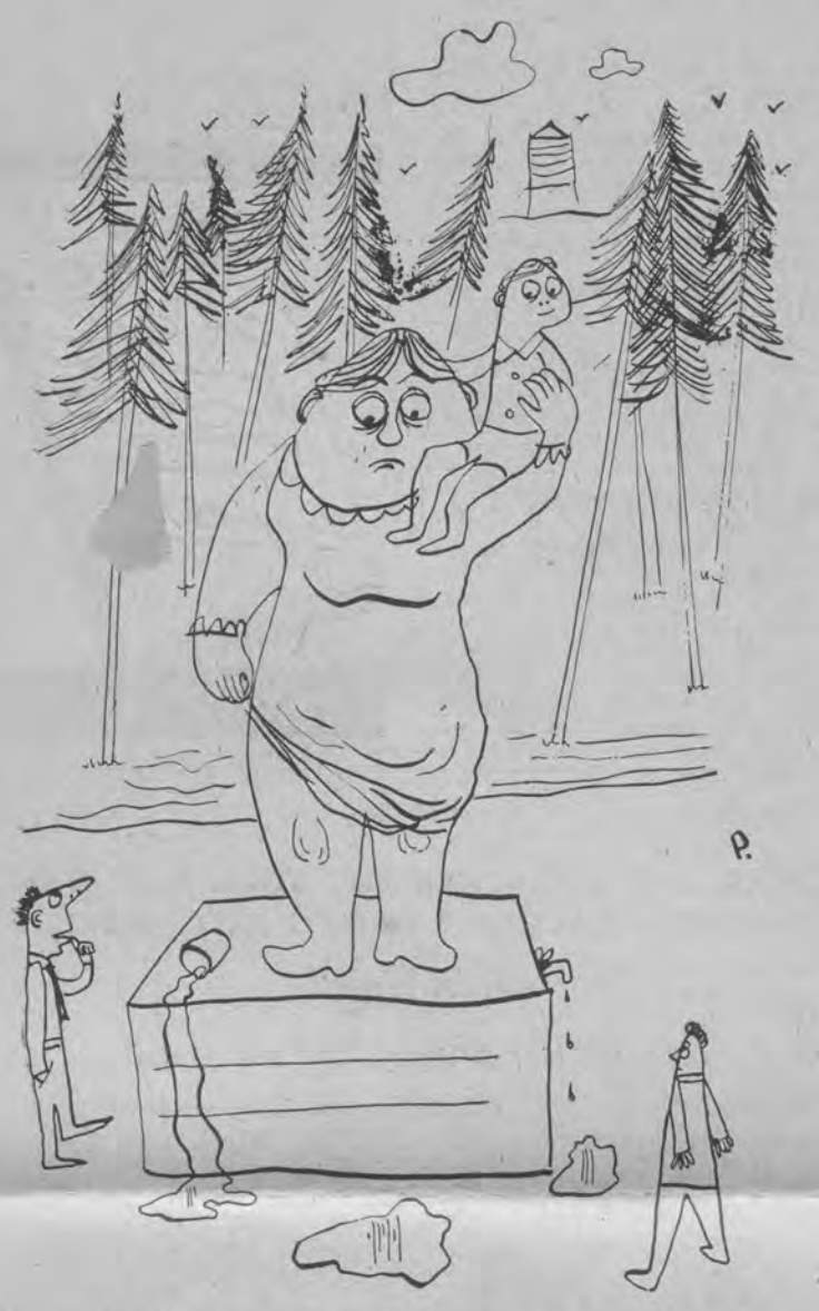
"This fountain is a disgrace. I'm leaving."