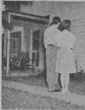
(Second in a series of articles on local organizations)

One of the town's oldest organizations, the Greenbelt Citizens Association, is in its seventh year of service as a sounding board of citizen opinion. Membership is automatically conferred upon all town residents and all work of the Association is done on a voluntary, non-dues-paying basis.