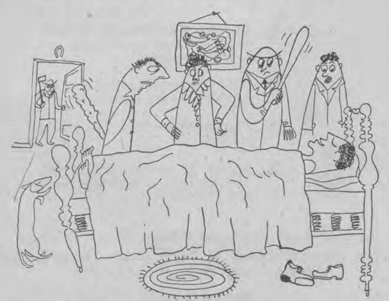
The Driver who oversleeps. The above solution occured to our artist in an inspired moment.