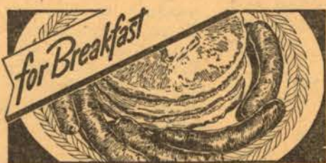
ARMOUR'S STAR Pure Pork Sausage

THEY'LL HIT THE SPOT ON EASTER—OR ANY OTHER MORN 38c per lb.