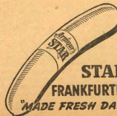
STAR FRANKFURTERS "MADE FRESH DAILY"

FOR A QUICK, TASTY EVENING SNACK 33c per lb.