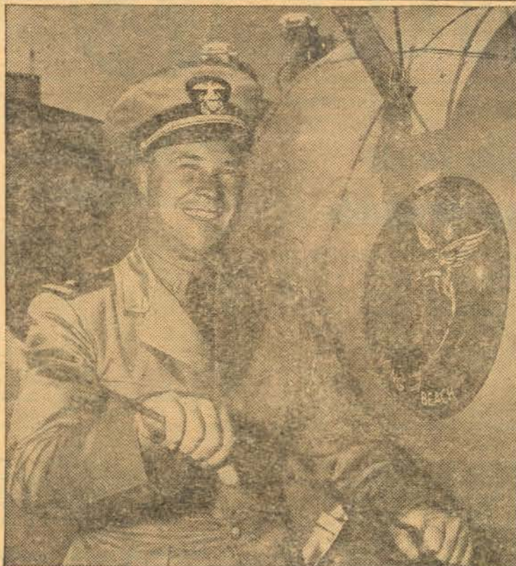
Ensign Wayne Morris Seeks Wings

Wayne Morris, recent star of "I Wanted Wings," became a member of Uncle Sam's Navy in May, 1941, when he was appointed to the rank of Ensign.