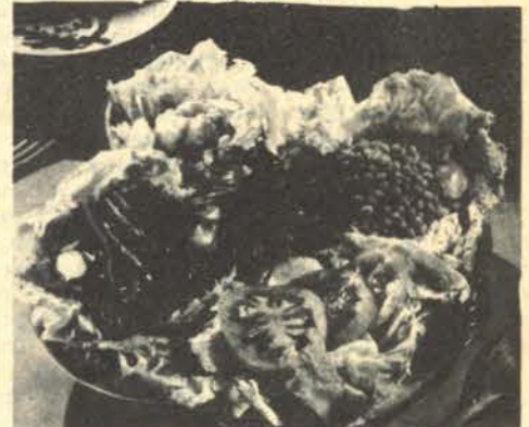
Spring Medley Salad

Lettuce Sliced tomatoes Cooked peas Watercress Cooked cauliflower Radish roses Cooked green beans Co-op salad dressing