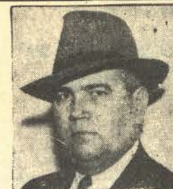
FASANKO SAYS: BUY WISELY

5200 Block Rhode Island Avenue — Warfield 0902 2 Doors So. New Court House Open Evenings & Sunday