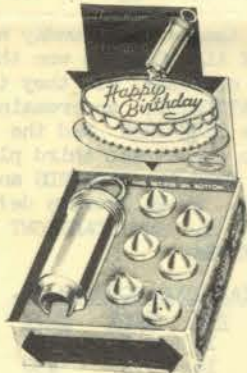
CAKE DECORATER SET — 25¢