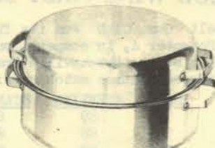
6lb ROUND ROASTER -- 69¢