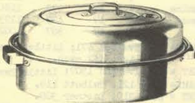
11lb OVAL ROASTER — 89¢