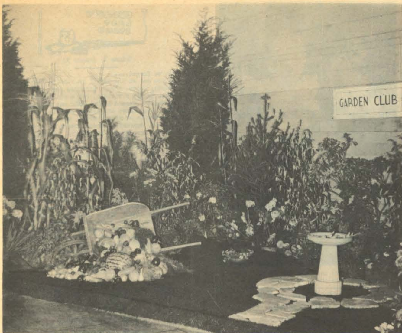
The Garden Club's grand prize-winning exhibit.