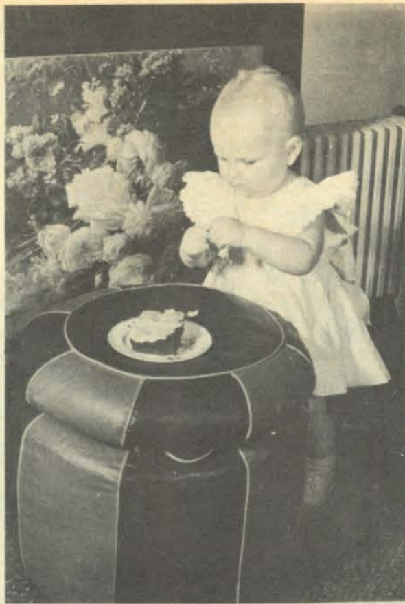
day. As the pictures indicate she is no cake-eater but spreads much more than one candle power of charm