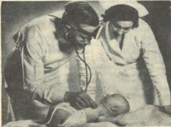
Why it pays to take your Baby to the Doctor once a Month

The family is reported to have gone to Ohio where funeral services will be held.