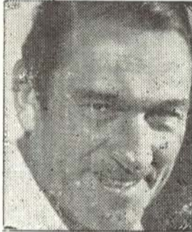
VICTOR McLAGLEN IN "THE INFORMER"

REVIVAL - Thursday - January 19 ONE DAY ONLY