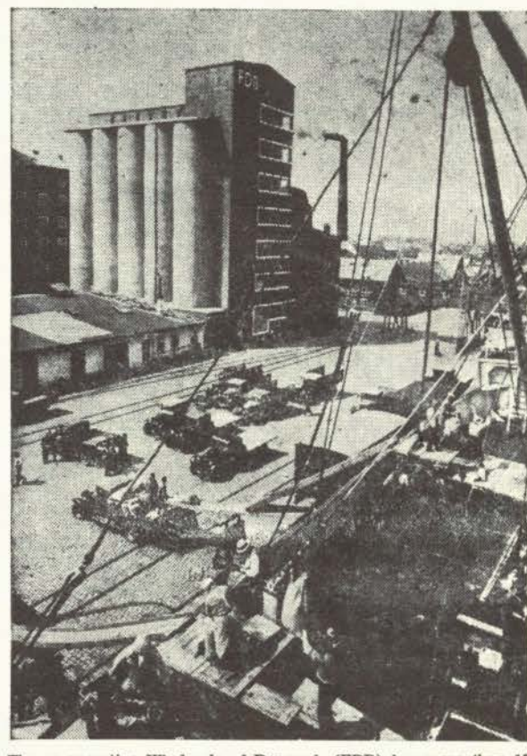
The co-operative Wholesale of Denmark (FDB) has more than 15 factories, producing soap, margarine, paper, bicycles, cotton, and shoes. Above is the flour mill on the busy waterfront at Vejle.