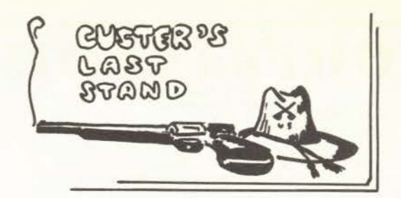
Volume 2 Number 6

Thus the health program of Greenbelt might have been formulated 30 years ago when Osler urged his colleagues to stand by ideals to make use of the unified great discoveries of prevention and cure of disease and to promote peace and concord in the community. We may be humble when we admit Osler anticipated our aims by a quarter of a century and pardonable will be our pride if we forget equivocal contra arguments and forge ahead with our campaign to make Greenbelt a model of Public health with all working in peace, unity, and concord.