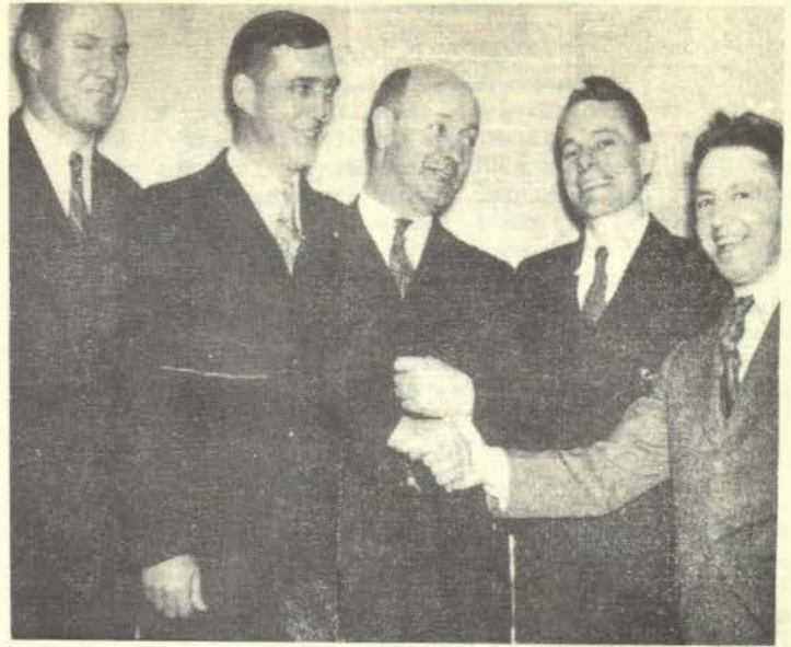
"THE FOUNDING FATHERS"- OUR FIRST COUNCIL

It should be clear from the above that the powers of the Town Council are both real and broad. Any idea that the Council is just a rubber stamp outfit, devoid of all power is erroneous, misleading and calculated to do the community harm.