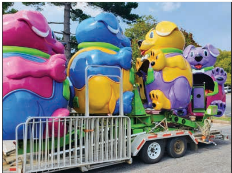
The carnival rides arrive for the Labor Day Festival.