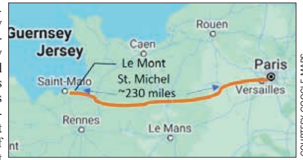
Paris to Mt. St. Michel is along the Véloscénie — a mostly off-road trail.

The island is like a volcano-shaped layer cake. The bottom layer is secular and the top layer is the abbey – with a clear demarcation between them. The town below the abbey is a welter of sandwich shops, souvenir shops and tackiness, though off the main trail there are tantalizing glimpses of a less-frenzied existence. The smaller lanes in the town are peaceful with stone cottages overlooking the bay. The views from the abbey ramparts are spectacular, and the interior is massive and striking. Pillars four feet in diameter and spaced only a handful of feet apart hold up the massive stone structure towering above. Chapel succeeds chapel as the tourist follows the route down from the top. But accessibility is not a priority and many older visitors were visibly