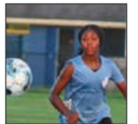
ERHS Soccer, p.11