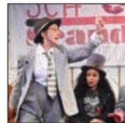
School for Scandal, p.8