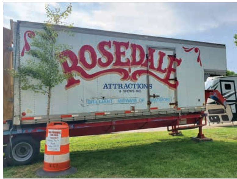
Rosedale Attractions is the long-time provider of carnival rides for the Festival.