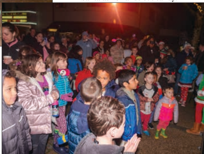
Children wait for Santa in Roosevelt Center.