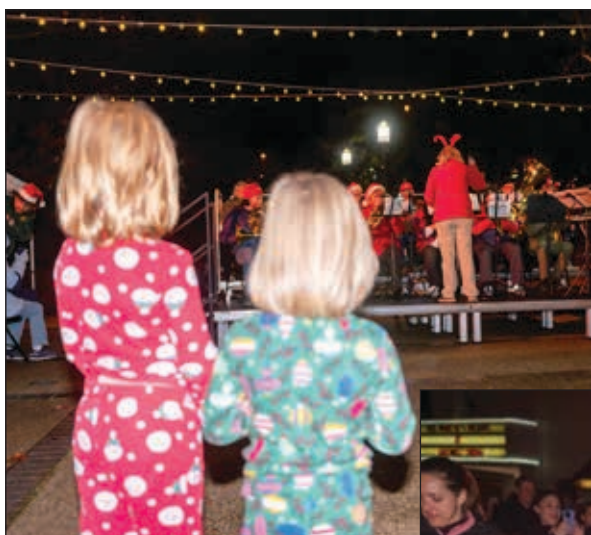
A pair of children in Christmas pajamas watch the band play on the stage as they wait for Santa Claus on December 1.