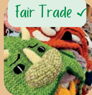
Fair Trade ✓