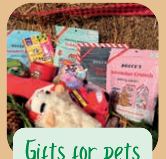
Gifts for pets