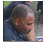
More SHL camp photos, p.12