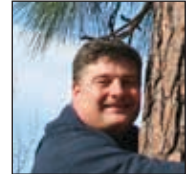
Greenbelt trees, p.6 & 7