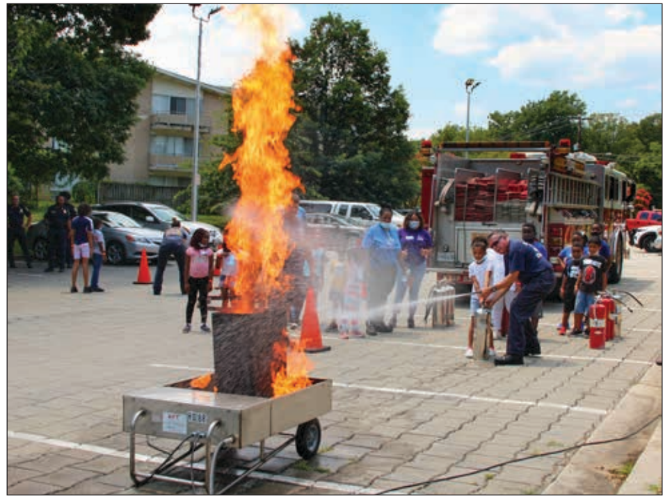
Greenbelt firefighters and police help out with the Springhill Lake Recreation Center half-day camp. This is the first year for the free camp, which is co-sponsored by Greenbelt Recreation Department and Boys and Girls Club of America. See story, page 1.