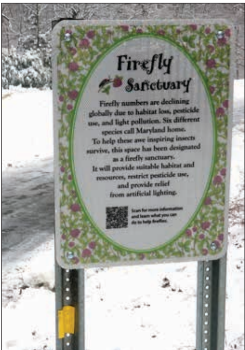
Visit the sanctuary soon or this could be the view.