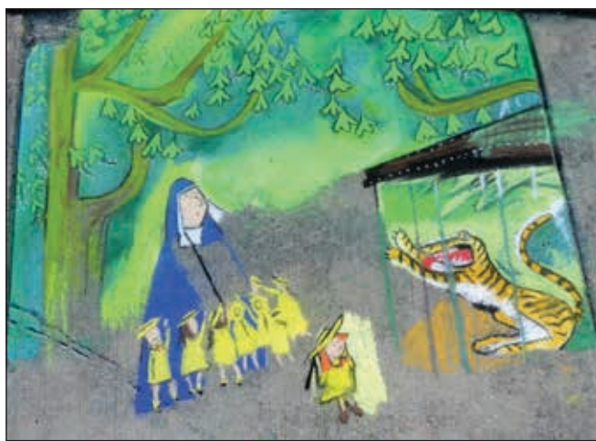
The Paris schoolgirl Madeline began life as a series of children’s books. Most recently, she has become the star of sidewalk art at Ridge and Gardenway.