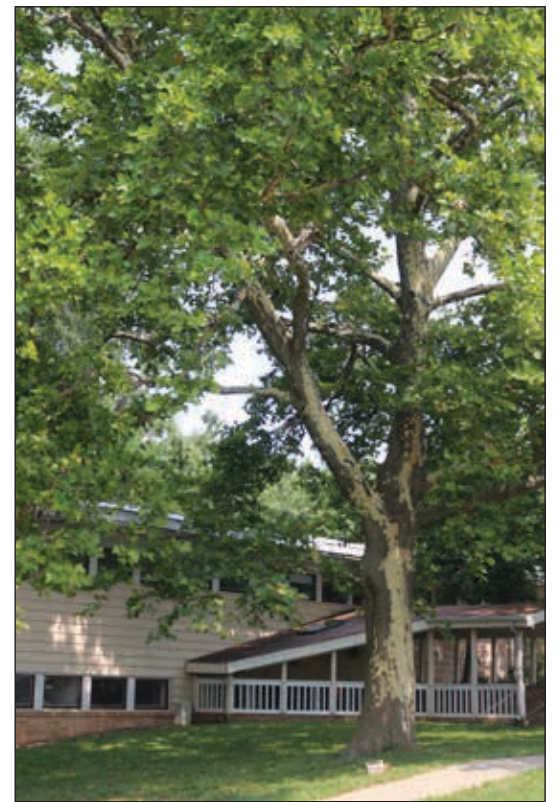
London plane tree near the Granite Building