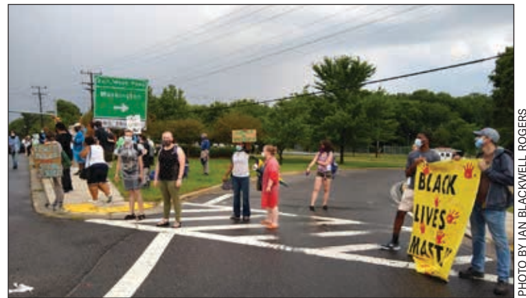
Protesters block the exit ramp from Kenilworth to Greenbelt Road.

If you are sending photos from your phone, please choose the option to send “actual size”, or upload the photos to your computer first and then email the photos at full size. Send photos to editor@greenbeltnewsreview.com.