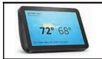
Amazon ECHO SHOW 8

Free Comcast Internet Essential Service (for 1 year)