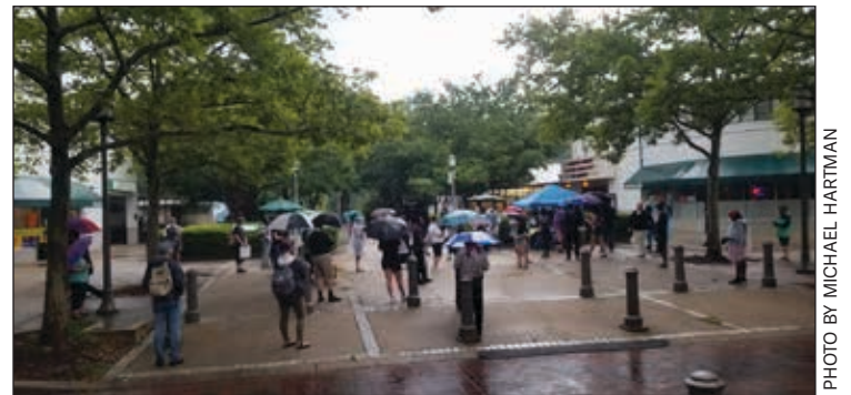
The rally ends with a closing ceremony in Roosevelt Center.