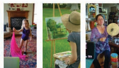
Music, Dance, Visual Arts and Ceramics for All Ages Live on Zoom!