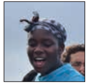
ERHS Soccer, p.11