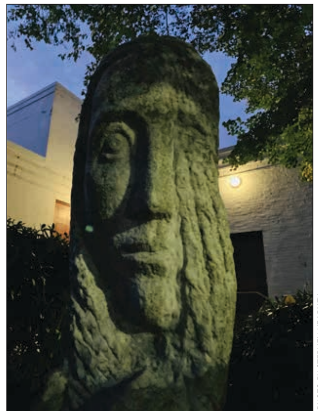
The Community Center friezes are lit up at sunset.