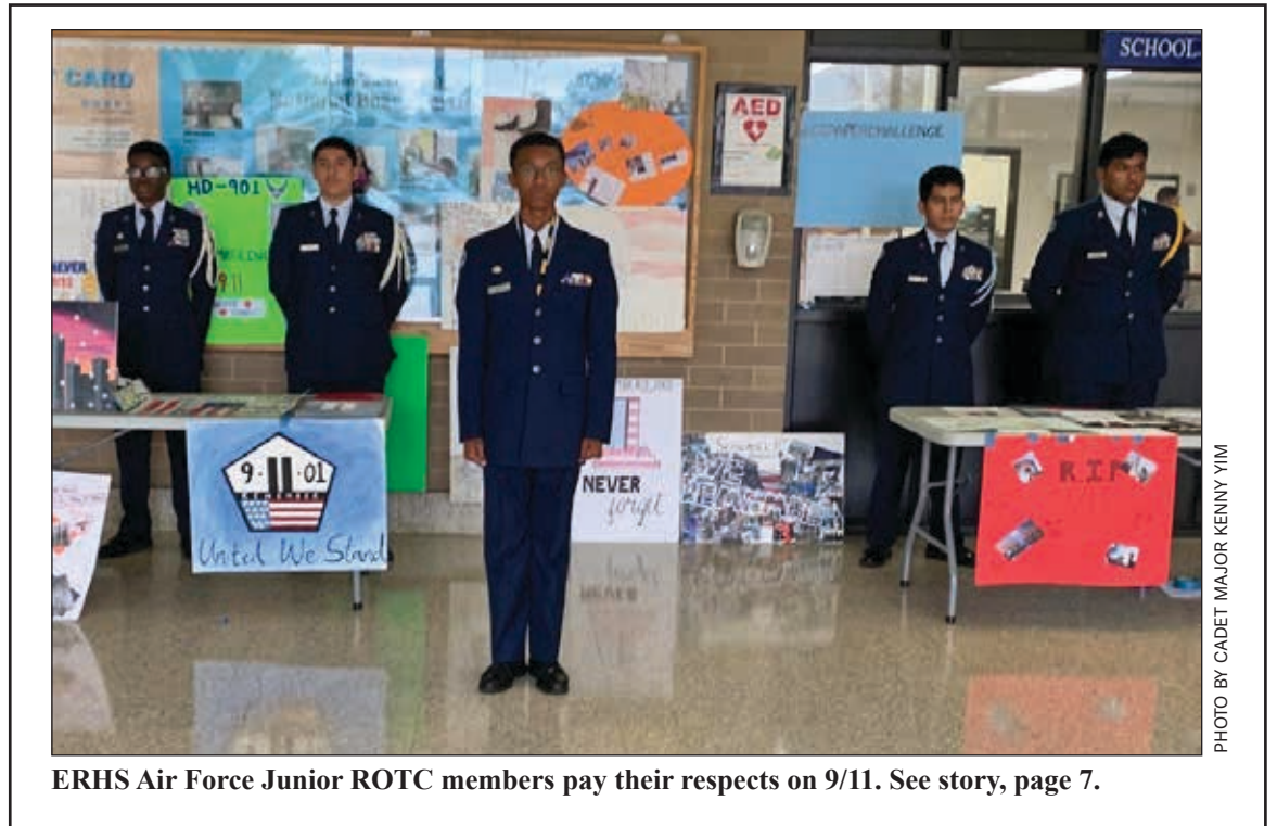
ERHS Air Force Junior ROTC members pay their respects on 9/11. See story, page 7.

Saturday, September 21 1 to 2:30 p.m. Open Forum sponsored by the Senior Citizens Advisory Committee, Community Center Monday, September 23 7:30 p.m. Drawing to Determine Order of Candidates' Names on the Ballot for the November 5 Election, Municipal Building 8 p.m. City Council Meeting, Municipal Building Wednesday, September 25 8 p.m. Council Worksession, Forest Preserve Code Changes, Stewardship Guidelines and Health Assessment, Community Center