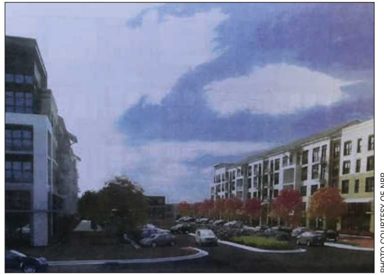
An architect's drawing of the proposed development on Ivy Lane