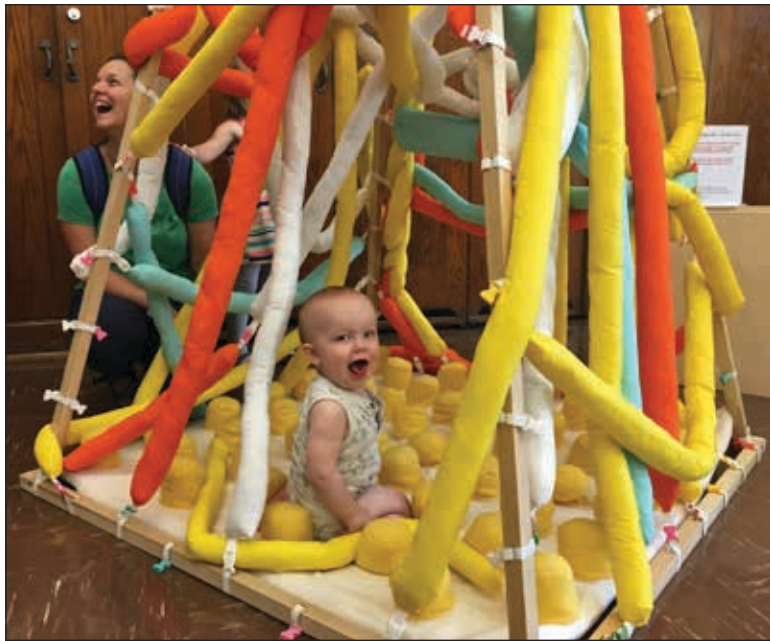
Visitors enjoy a gallery exhibit during the Labor Day Festival.

In addition to Co:Structure , Guo contributes a large piece entitled The Weight Between You and Me . An unpainted frame of stock lumber supports two soft, thickly woven basket chairs in a suspended teeter-totter. Visitors are invited to don the orange hard hats provided and ride the sculpture. What they are building in this case is not a physical structure or environment, but a social space of trust and collaboration.