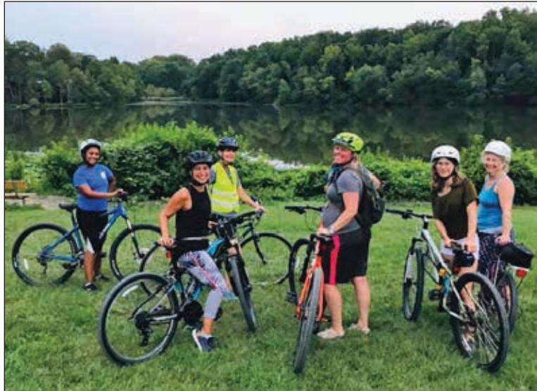
The city-sponsored women's bike ride on August 1 attracted eight riders who braved the heat and rode to Silver Diner for a shake. They rode back via Buddy Attick Park and posed for a photo next to the lake.