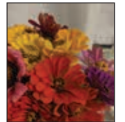
Farmers Market Zinnias, p.7