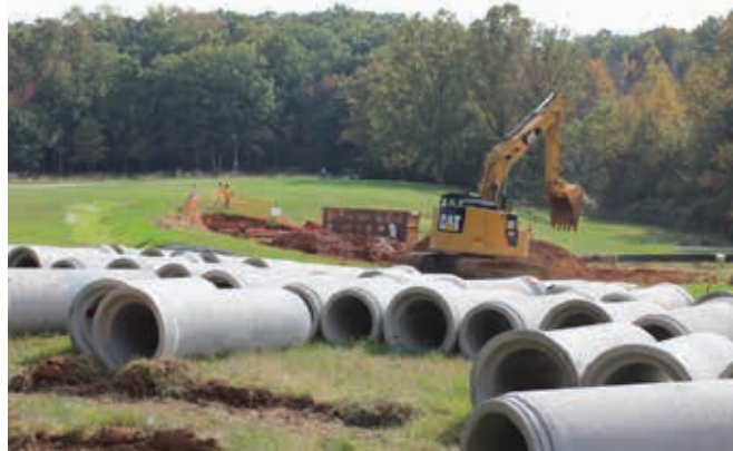
Project expected to take approximately 7 months to complete