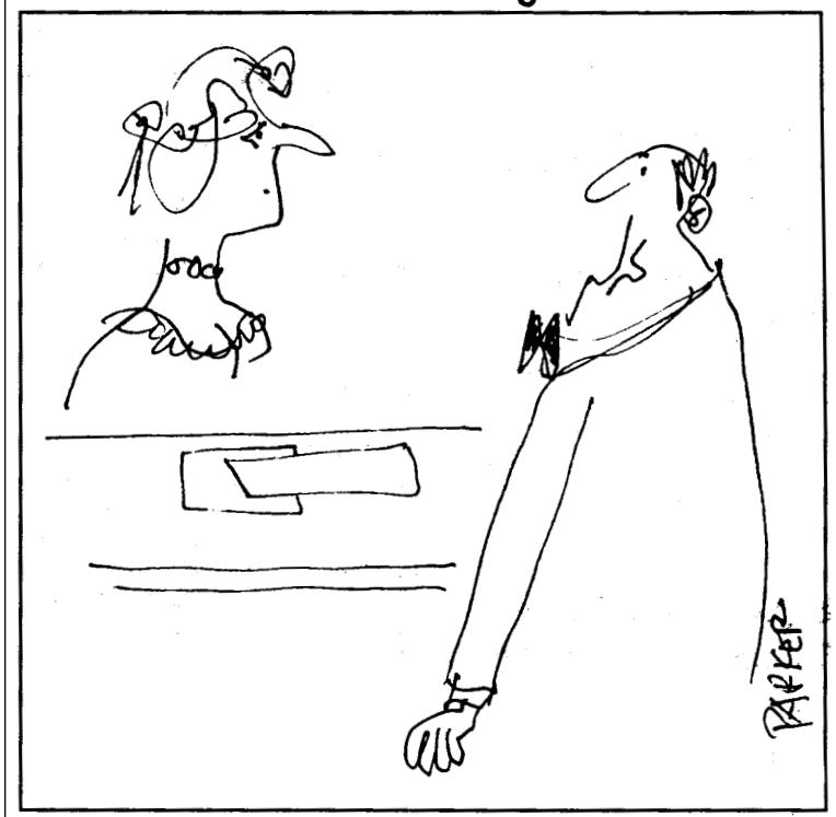
"I want to file papers to run for council..... I'm a glutton for punishment!"