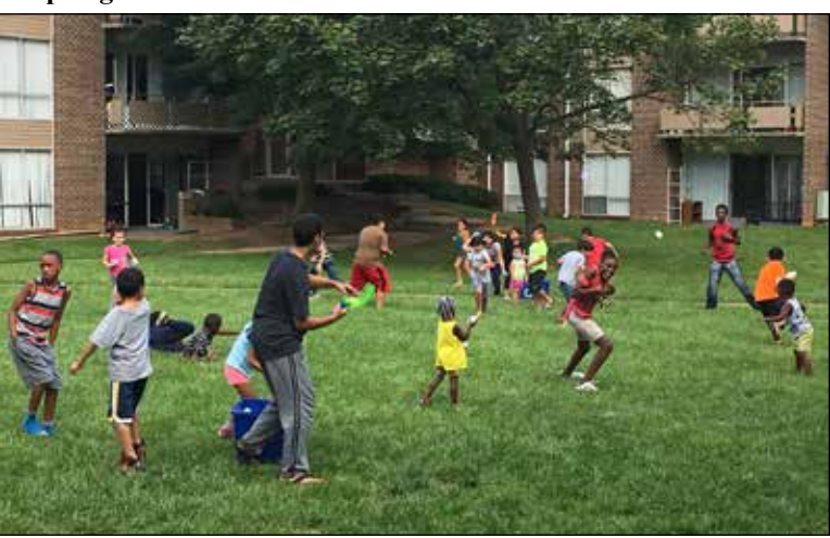
Balloon Battle of Springhill Drive