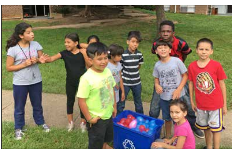
Before the start of the Balloon Battle on Saturday, September 16 at Springhill Drive