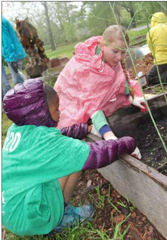
Volunteers work on a planting project.