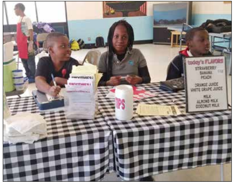
BizKidz members take orders for smoothies.