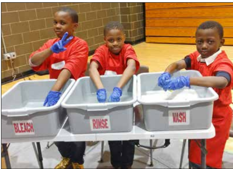
The clean-up crew takes care of the dishes.

amic Community Governance (CDCG) and was inspired by its governance strategies for this project.