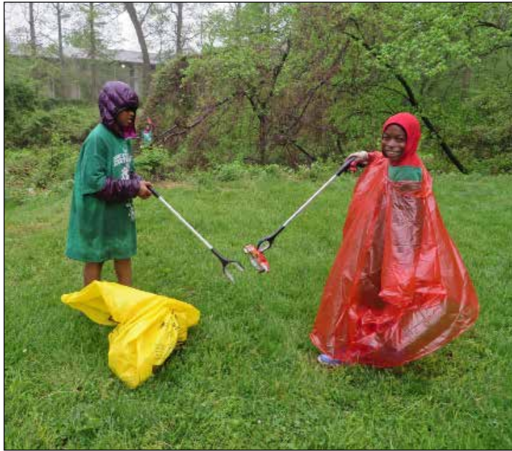
Earth Squad members help to clear litter from Indian Creek.

Thanks to Bagel Place Bagels of College Park for donating