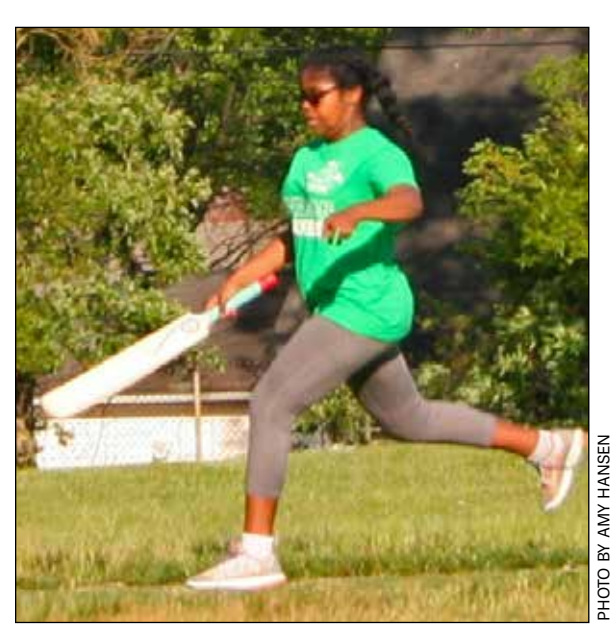
A girl from Kenmore Elementary bats in the All Star cricket match on June 7.

As the enthusiastic fans retreated to their cars, it was clear the game would be repeated next