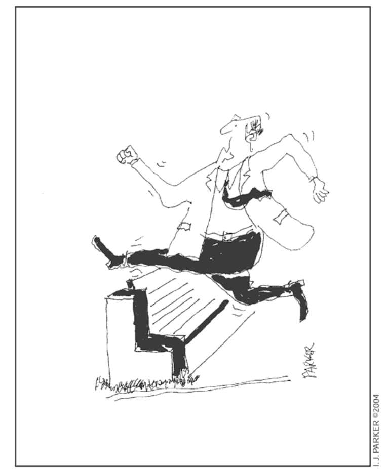
"Too bad there isn't an Olympic gold medal for getting to work on time!"

Originally published on August 19, 2004.