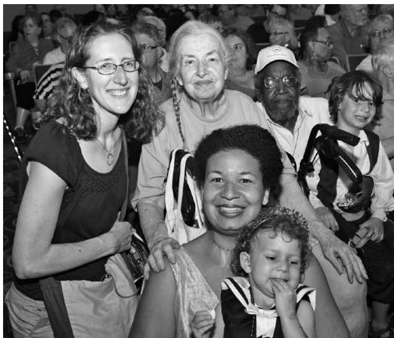
The Jones/Waters family enjoy the festivities