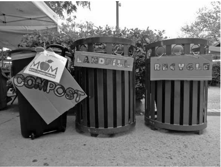
Zero waste station with compost, recycle and landfill bins clearly labeled.

On December 31, Greenbelt rang in 2015 with a New Year’s Eve party at Greenbelt Arts Center, highlighting a zero waste effort led by the Butterfly Brigade. This event, which used reusable plates, cups and napkins as well as recycling and composting, resulted in just one grocery-sized bag of trash going to the landfill from over 100 party-goers. The idea of zero waste had more than just a short-lived resolution for 2015. The idea was transformed into greater reality when Susan Barnett, member of the Butterfly Brigade and Greenbelt’s Green Team, initiated a Zero Waste subcommittee of the city’s Green Team. In this framework, she volunteered to lead a much larger zero waste effort at the 11th Annual Greenbelt Green Man Festival. In partnership with other groups and individuals, the Green Team championed the effort. Zero waste is defined as an