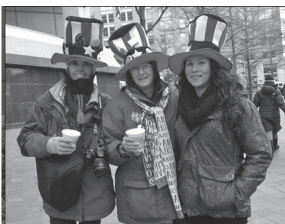
Three women show off their Obama attire.

While I was pondering my (limited) options, another woman offered to put my pack in her newly-acquired Obama tote bag. In so doing, she tore the handles off her bag but continued to stuff my bag. True enough, because my bag couldn't be