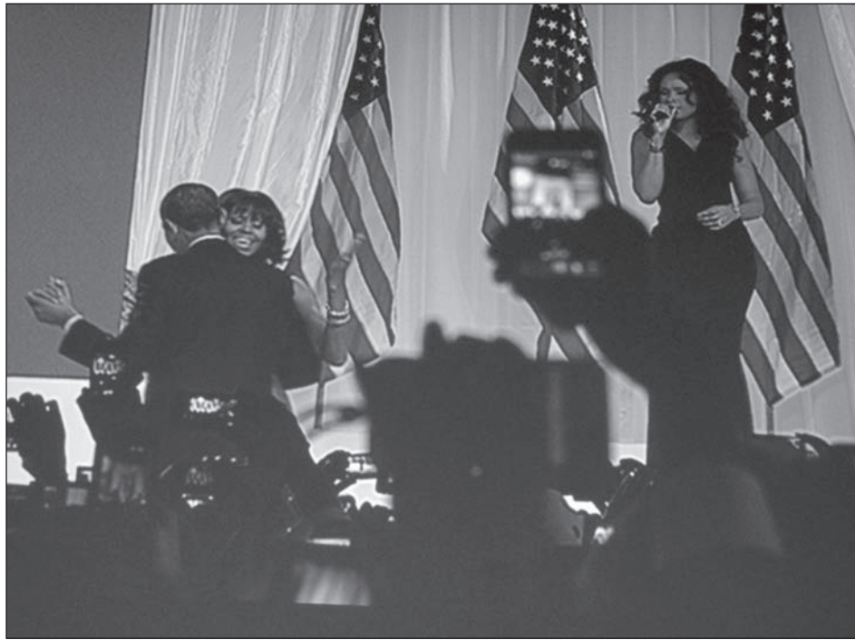
At left, the President and First Lady dance to the music of Jennifer Hudson at the Commander-in-Chief's Inaugural Ball at the Convention Center.