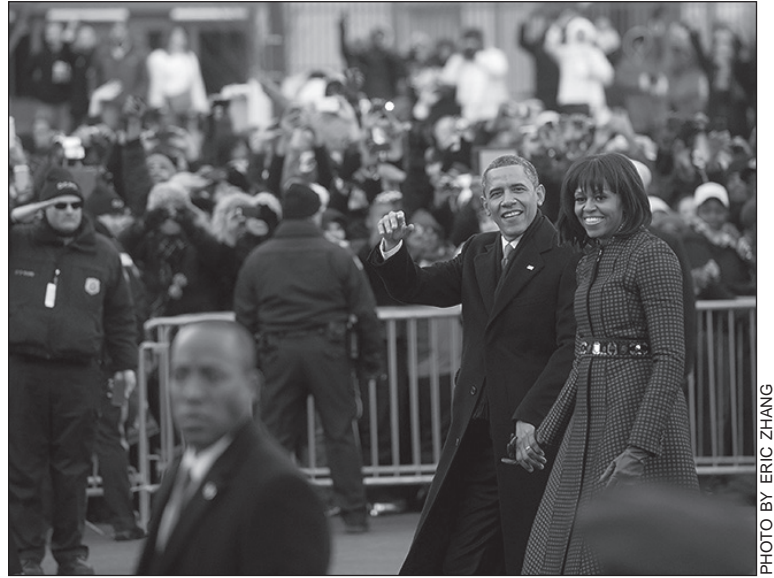
President Obama and First Lady Michelle Obama walk down Pennsylvania Avenue during the inaugural parade.