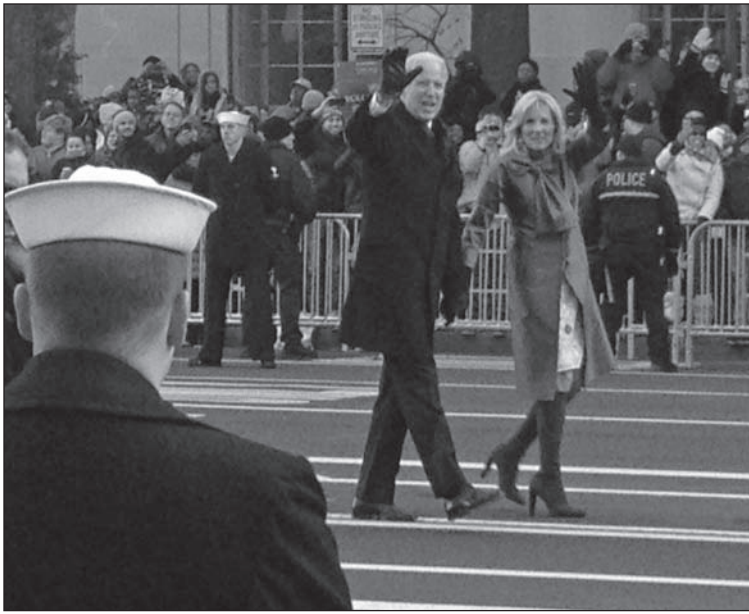
Vice President Joe Biden and his wife Jill in the Parade.

again embraced the inaugural day. This time I chose to experience it through the lens of the inaugural parade. So this year, at a more leisurely hour, I hopped on my bike, riding past the Greenbelt Metro (where the parking lot was full by 9 a.m.) and where throngs of people were lining up around the Metro card vending machines. I took to the streets for a beautiful, brisk almost silent ride down Rhode Island Avenue to the National Mall. It seemed as though no one was outside.