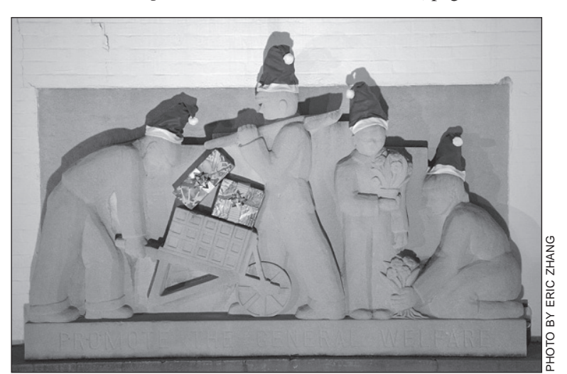
Stocking caps adorn heads and gifts fill the wheelbarrow on the bas relief at the Community Center.