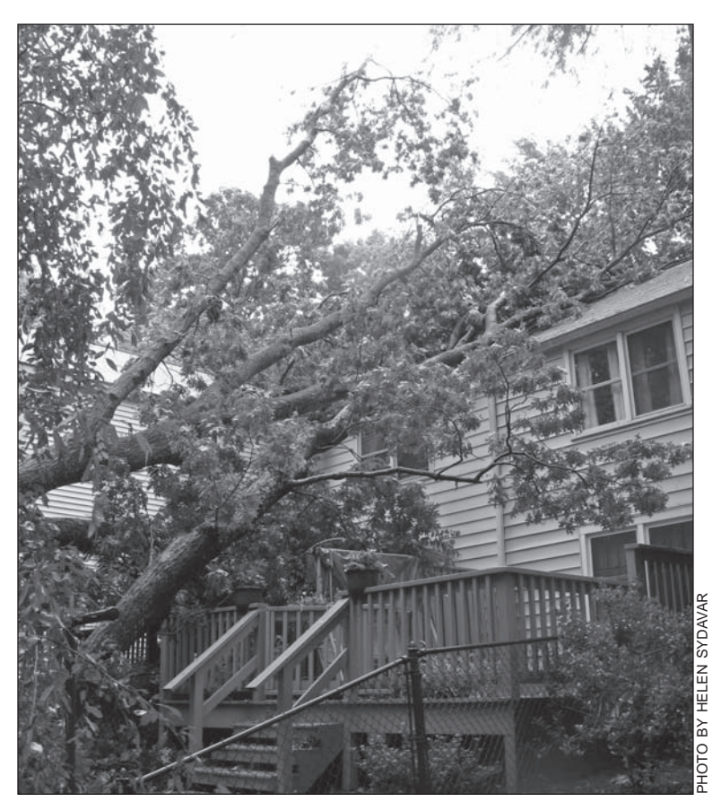
An oak tree rests across homes in 46 Court Ridge.

Sunday. She observed convoys of utility vehicles and power equipment headed north on I-95. One group of about 30 vehicles was from Louisiana. She also saw trucks carrying utility poles.