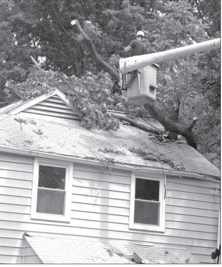
A large tree fell in 20 Court Hillside, poking through the roof and damaging the electrical supply. Monday Asplundh arrived to remove the tree with the assistance of a crane from Digging and Rigging.

Then Pepco must restore service lines and replace damaged meters. If Pepco is delayed GHI may provide a generator to restore power to the row.