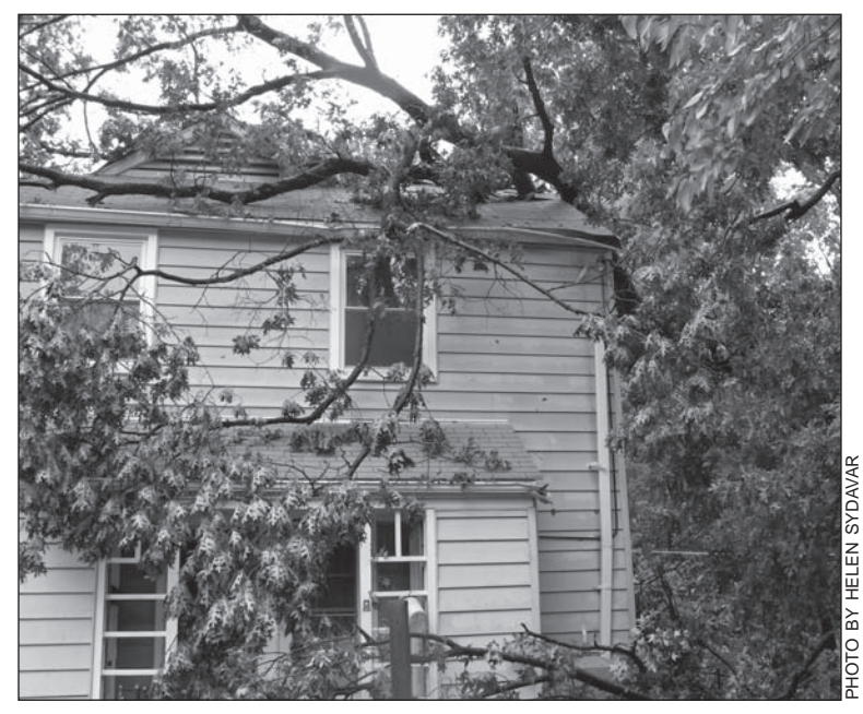
Part of a forked tree that fell at 20 Hillside Road in Old Greenbelt at 4:30 a.m. on Sunday morning, August 28 from Hurricane Irene.