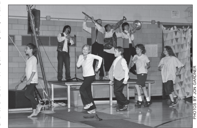
The performers' grand entrance is accompanied by taped music and miming musicians.