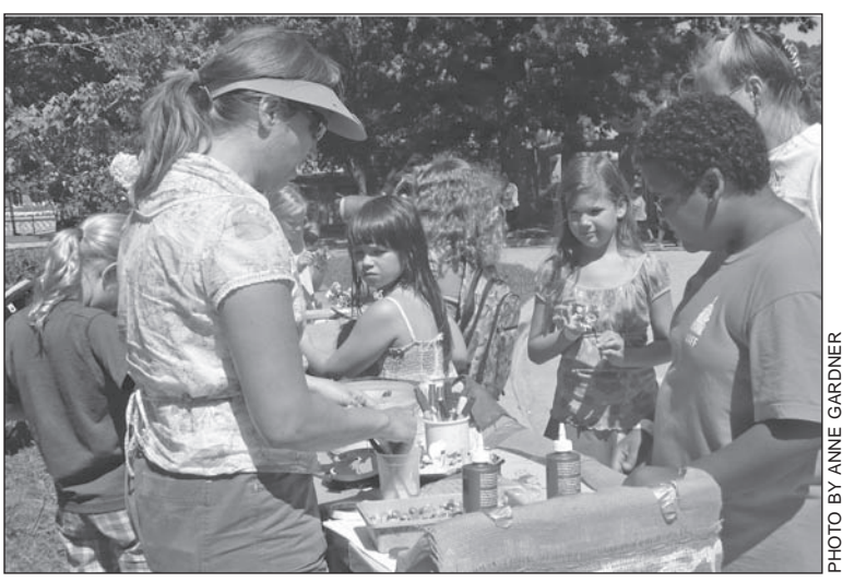
2010 midway art carts. The carts return this year with new projects.