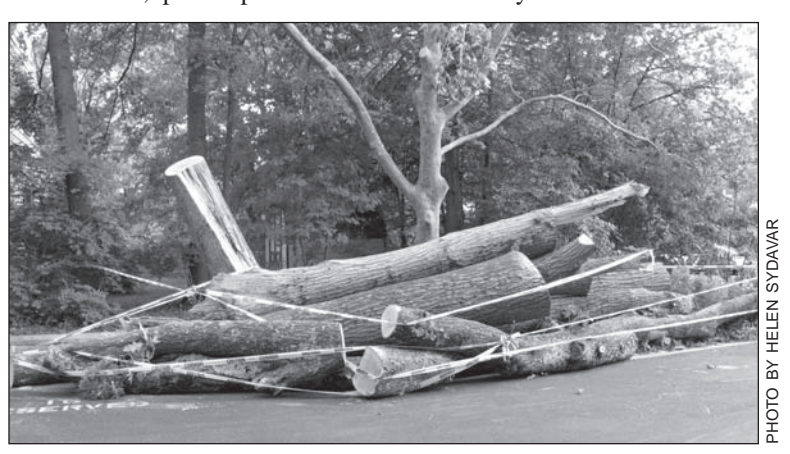
Above, a branch pile at 46 Court Ridge after tree removal, showing the size of the tree that was damaged.

All Prince George's County Public Schools were closed on Monday. Magnolia and Glen Arden Woods Elementary Schools were still closed on Tuesday for lack of power but only Glen Arden Woods remained closed on Wednesday.