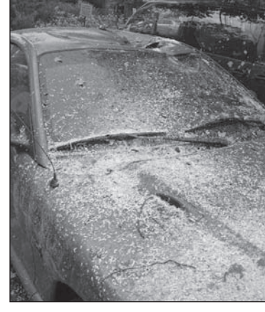
GHI's crew responded Sunday about 9 a.m. to remove limbs around two cars using chainsaws. One vehicle was severely damaged.