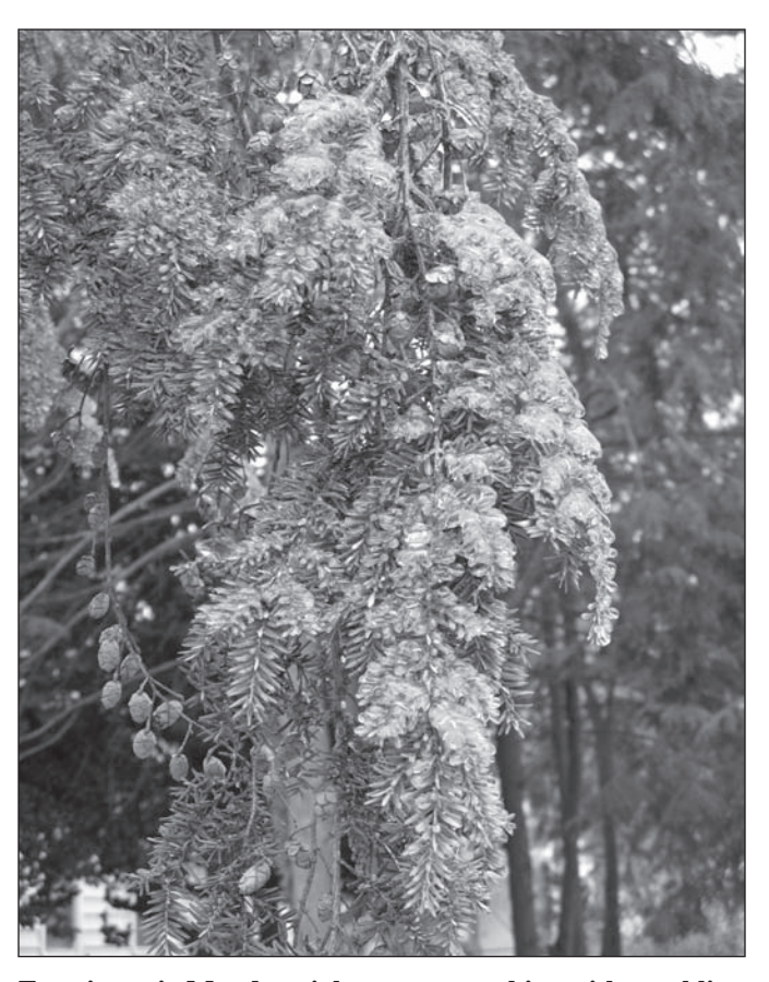
Freezing rain Monday night coats everything with sparkling beauty but treachery underfoot.

For more information email the College Park Arts Exchange at info@cpae.org or call 301-927-3013.