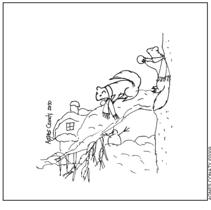
"I could use a snow blower for Valentine's Day."