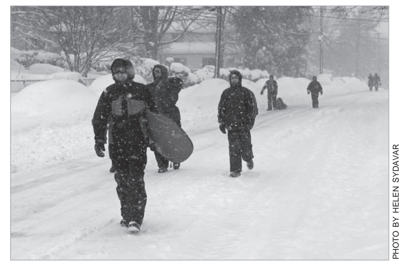
On Saturday, with snow still falling, and power out in old Greenbelt, sledders were out on Southway in search of the perfect hill.

Call Beth 703-980-0667 bleamond@gmail.com