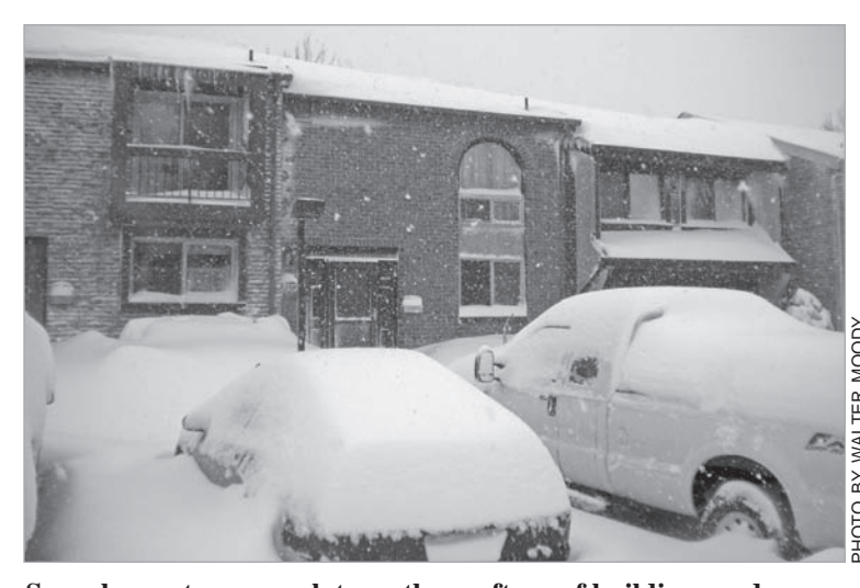
Snow began to accumulate on the rooftops of buildings and cars in Greenbelt East early Saturday.