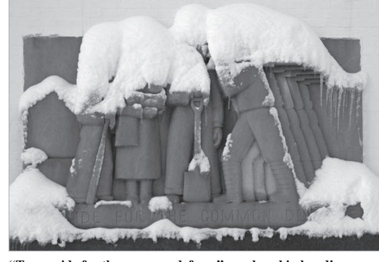
"To provide for the common defense" . . . shovel in hand!