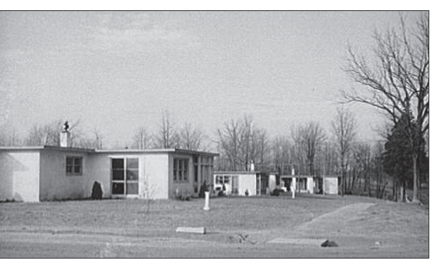
the leading edge of The Jersey Homesteads, built in the late 30s, reflects the Bauhaus-inspired residential architec- style with flat roofs, unadorned facades and horizontal orientations.

For more information call 301-507-6582, email museum@greenbeltmd.gov or visit the Greenbelt Museum website at www.greenbeltmuseum.org.