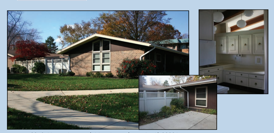
Location 3370 Gleneagles Drive | Silver Spring | Maryland | 20906

CONSIDER THIS: Enjoy a fire in the fireplace this winter knowing that there is no snow to shovel! Home is light and bright! Tons of closets! Enclosed patio for warm weather enjoyment. One fee pays taxes, utilities, maintenance, cable etc. You just pay telephone extra. Staff maintains even the appliances. Many community amenities!!! Call or email Mary to learn more and set up appointment to visit: 240 604 6605, mary.kingsley@gmail.com