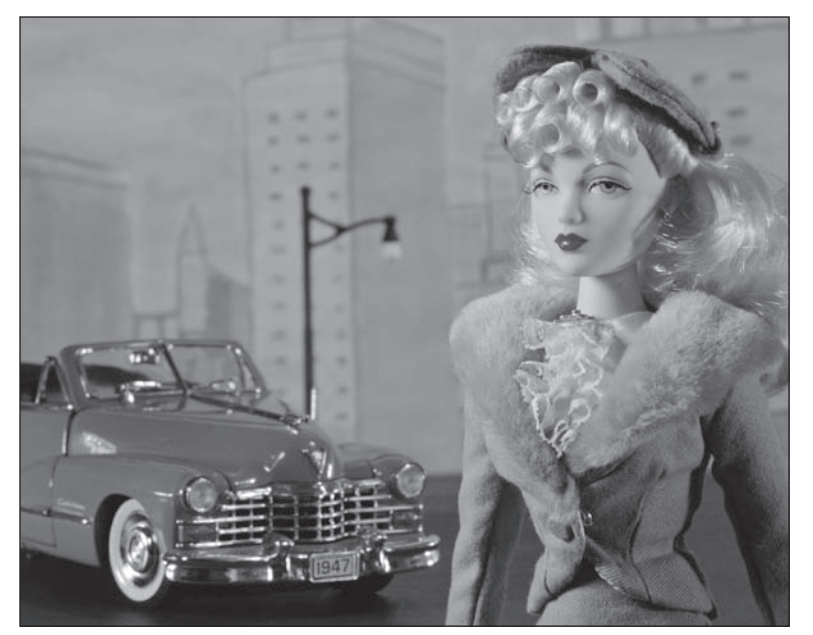
One of the art pieces on exhibit by Bright Side Pictures, a collaboration of three artists, at the New Deal Café.