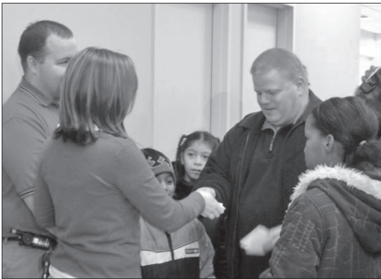
A Target manager hands out gift cards to the Greenbelt police officers on Saturday, December 22. The officers then help the children buy Christmas gifts for themselves and family.