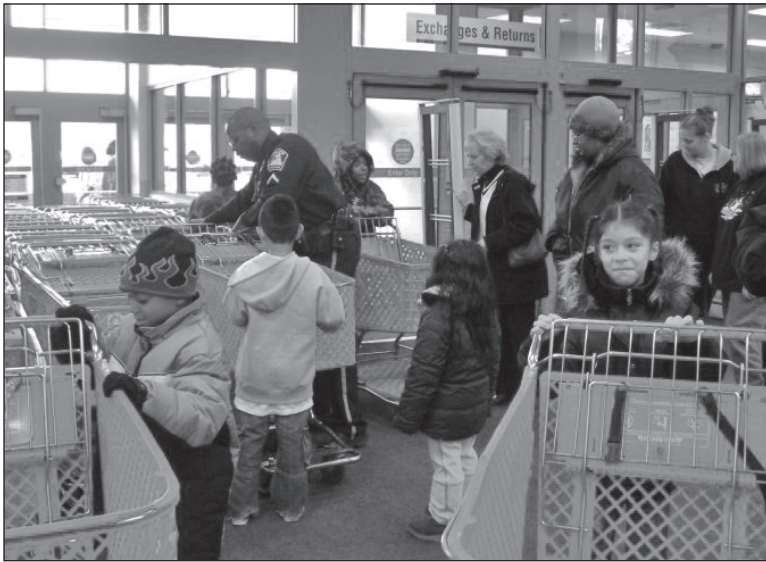
Cops and kids find carts inside the front doors at the Greenbelt Target in preparation for "Shop with a Cop" day.

In addition, the families of each participant were given a $50 gift certificate to Safeway to help with Christmas dinner, provided by donations from the Faith Baptist Church of Laurel.