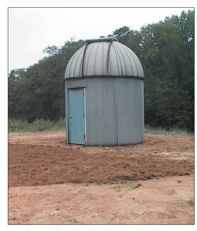
Finishing touches positioned the J-bolts in place in order to prepare the new foundation on Observatory Hill to accept the observatory building. Stairs were built before the telescope was put in place on the central pier. The finished observatory is now in place at the end of Northway across from the ball fields.