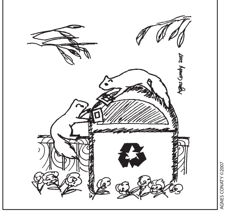
"Got a bunch of 'Forever' postage stamps stowed away just in case . . . ."