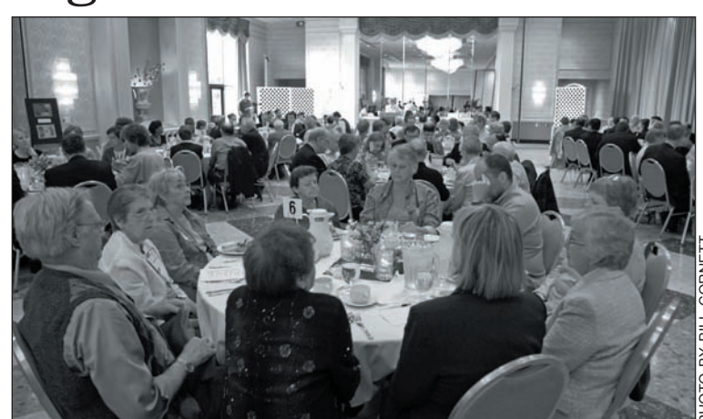
The event drew a larger than expected crowd interested in learning about the Greenbelt Foundation.

More than 175 people, nearly double the expected number, filled Martin's Crosswinds for an early morning breakfast on May 2 to learn more about the Greenbelt Community Foundation.