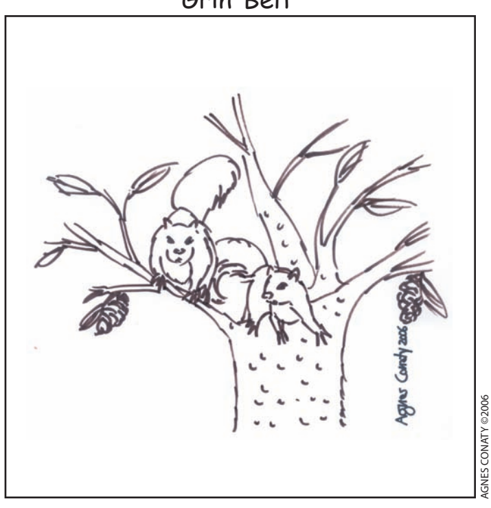
"After all these spinach, carrot juice, lettuce and ground beef contamination scares, I'm going nuts!!!"