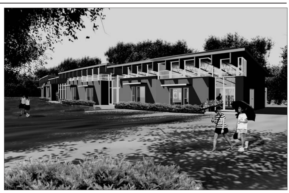
by about a dozen An architectural rendering of the new Friends Community School shows off the environmentally-friendly features that are planned, including straw-bale construction, a "green" roof and radiant floors.

Currently located in College Park, the Friends Community School assumed ownership of the property located in the former Jaeger Tract adjacent to Green-