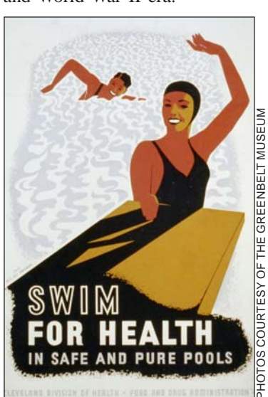
This WPA poster promoted swimming pools.

The Greenbelt Museum sponsors a bi-monthly lecture series that is free to the public. The lectures explore aspects of the history of the Great Depression and World War II era.