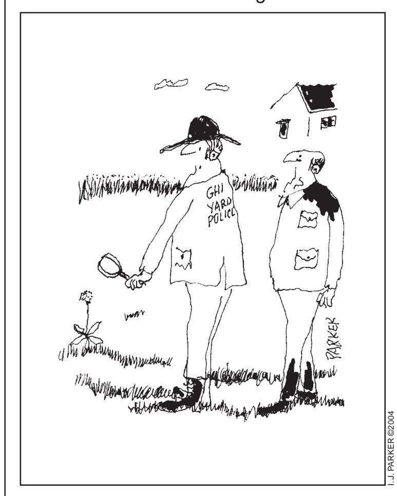
"Remember . . . beauty lies in the eye of the beholder!"