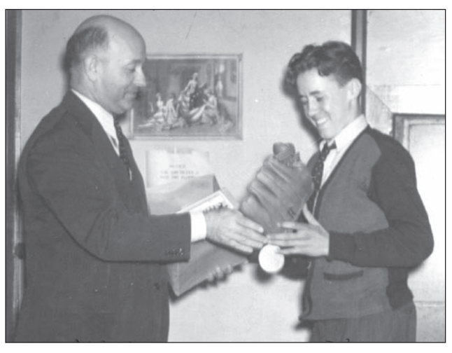
The exhibit features three-dimensional artifacts from ball team. 1940.

In conjunction with this exhibit the museum is sponsoring a free lecture and slideshow titled "Women in Sports: Play Day to Elite Competition, 1923-1953." The program will take place on Tuesday, May 25 at 7:30 p.m. in the Greenbelt Community Center, Multi-Purpose Room 201.